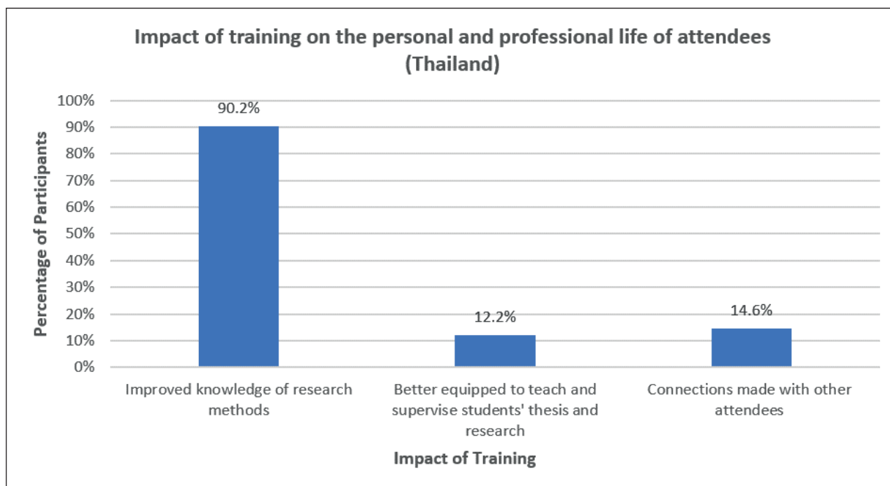
Figure 2: Impact of training on the personal and professional life of attendees.