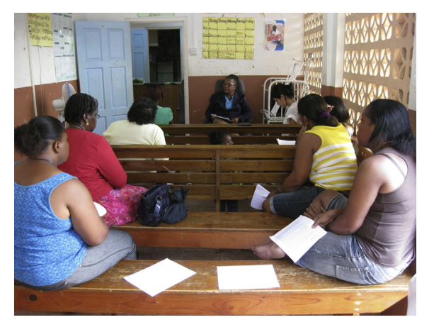
Figure 2. Preintervention focus group at the Barrouallie Health Center.

The qualitative information gathered from the focus groups informed the rollout of the self-help groups. Self-help group participants were recruited by word of