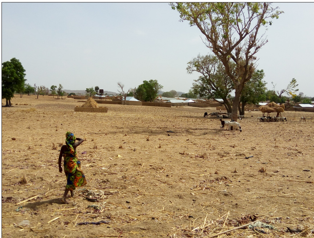
Figure 2 A child walks home on the outskirts of Abare Village, Zamfara State in 2011.

Rates of preventable diseases soared, and polio made a resurgence [16, 18]. Aid organizations such as Médecins Sans Frontières (MSF, Doctors Without Borders) began regularly surveilling for outbreaks of cholera, malaria, measles, and meningitis. MSF was on such a surveillance mission in 2010 when health workers in remote areas of Zamfara reported high mortality rates in children in Anka and Bukkuyum Local Government Areas [1]. Acute lead poisoning was eventually identified as the cause, and a multidisciplinary response team investigated and found the affected communities were deeply involved in artisanal gold mining [2].