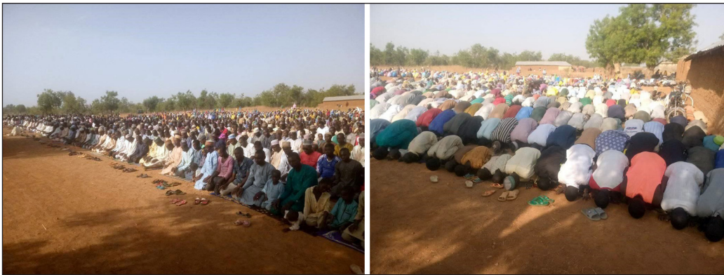
Figure 8 Residents of Bagega Village in Zamfara State, Nigeria at a mass prayer for peace (2020).

Environmental health crises related to ASM will continue to occur in marginalized communities for as long as global markets demand coltan, gold, and other minerals. This was clearly demonstrated in Zamfara, where the dramatic increase in gold value was partially responsible for the lead poisoning outbreak [1, 3, 24]. Demand for metals is expected to intensify with the production of low-carbon energy alternatives. The World Bank estimates a 585% increase in the demand for cobalt by 2050 in order to meet demand for renewable energy alone [122]. Most of the world's cobalt comes from mining in the DRC, a country that has been embroiled in violent conflict for decades and where other mineral resources, such as coltan, are used to fund multiple armed groups [123, 124]. With increased global demand for and production of mineral resources, there is a risk that conflicts over nonrenewable resources will amplify if environmental and health impacts are not mitigated and economic benefits are not equitably distributed [9, 67, 125].