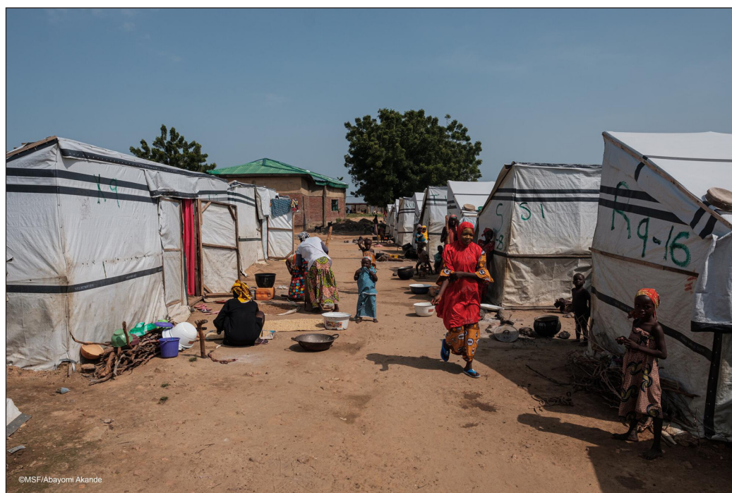
Figure 6 A camp for people displaced by regional violence in Anka, Zamfara State, Nigeria in October 2020. Many people living in the camp were once residents of the villages impacted by lead poisoning in the previous decade.

The security situation has serious implications for MSF's lead chelation treatment program. Medical teams can no longer access impacted villages to support safer mining practices or to distribute medications due to the high risk of robbery or kidnappings on the roads [5, 42]. The organization currently runs a camp in a nearby town for people displaced by the violence [43]. In response to the violence, the Nigerian federal government enacted a temporary ban on all artisanal gold mining, but many experts doubt that this will have an impact on the security situation and fear that it could force the industry "underground" and recreate unsafe ore extraction activities that caused the high mortality seen in 2010 [44].