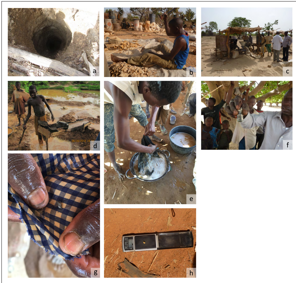
Figure 3 Photo series of gold ore processing in Zamfara State, Nigeria: a , ore is sourced from mines across the region and transported to processing areas; b , ore rock is broken by hand into gravel-size pieces. c , modified grain mills are used to grind ore into a flour-like consistency; d , sluice boards are often used to gravitationally separate gold particles from silica and other contents; e , contents of the sluice carpets are washed into a container; f , mercury is added to the sluiced concentrate; g , a mercury-gold amalgam is obtained, which will then be heated, vaporizing the mercury; h , the final product is ready to be sold to dealers who visit the mine sites regularly.

impoverished Hausa villages rapidly increased when gold prices shot up during the 2008 economic crisis. Second, a new vein of ore was discovered late in 2009 that, in a cruel twist of geologic fate, contained 10% (100,000 mg/kg) lead [20]. And third, ore was processed in residential areas, either in public areas around the community or within the walled homes by women secluded under the Sharia Law practice of purdah .