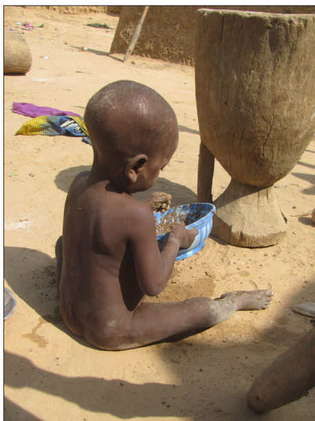
Figure 4 A boy plays with soil on the floor of his home.

Lead is a potent neurotoxin that is especially harmful to the developing brains of young children. In Zamfara in 2009–10, lead-rich ore dust covered the soil floors of homes ( Figures 4 and 5 ), became incorporated into foods prepared and served on the ground, and rapidly left many children