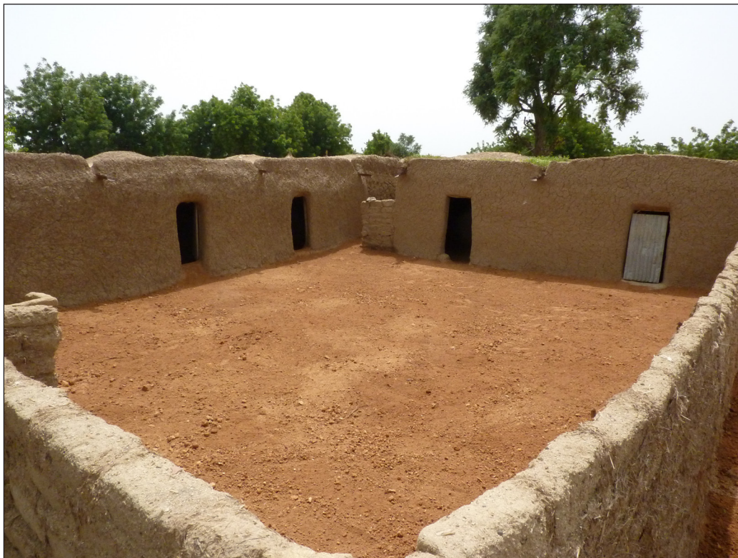
Figure 5 A recently remediated home in Zamfara State. Contaminated surface soils have been excavated and replaced with soils certified to be <20 mg/kg Pb.

Over the next three years, TerraGraphics International Foundation (TIFO) worked with MSF and the Zamfara State and Nigerian federal governments to address the epidemic in eight Zamfara communities. The response was unprecedented in both Nigeria and the world. Cleanup procedures were modified to accommodate emergency medical treatment timelines, limited resources, remote location, and Sharia Law [1, 24]. Mortality rates decreased from 30% to <2% [1]. The last Zamfara village was remediated in 2013; two years later, a similar ASGM-related lead poisoning outbreak was discovered in neighboring Niger State [29]. The Nigerian government, MSF, and TIFO collaborated to respond again, addressing exposures in two remote villages. MSF has continued to treat children for lead poisoning with chelation therapy in the impacted villages, expanding the medical program to include support for local institutions to manage transient recontamination that occurs from mining camps. MSF also supports a safer mining program to reduce lead and silica dust exposures for workers in the region [30, 31].