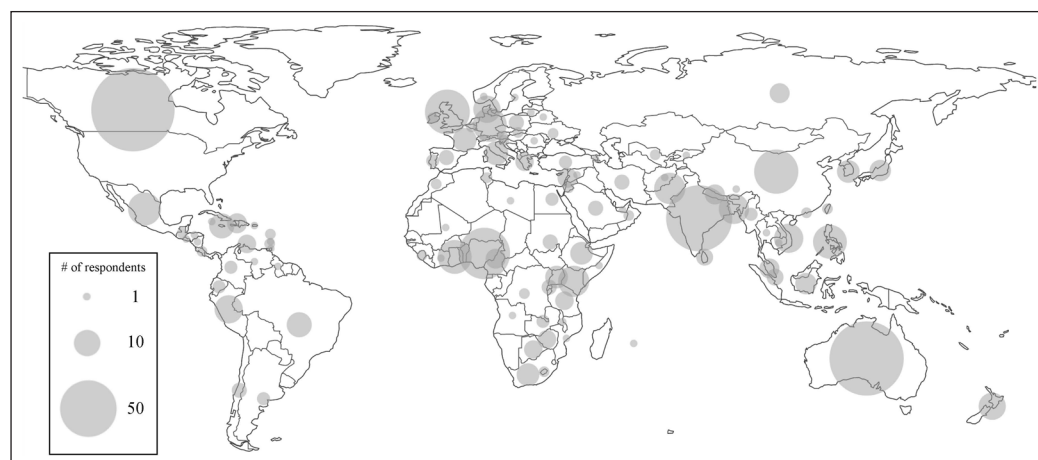
Figure 1 Bubble map depicting the geographic distribution of respondents by reported citizenship excluding United States. Size of the bubble is proportional to the number of respondents from each country.